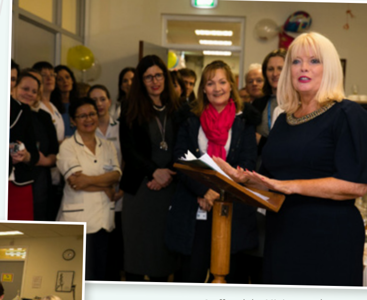
Staff and the Minister at the event