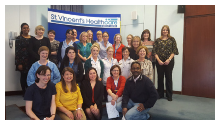
SVUH staff group at the presentation of certificates ceremony for the SVUH/ UCD Accredited Management Development Programmes

A number of SVUH staff members receiving their Certificate for the SVUH/ UCD Accredited Management Development Programmes